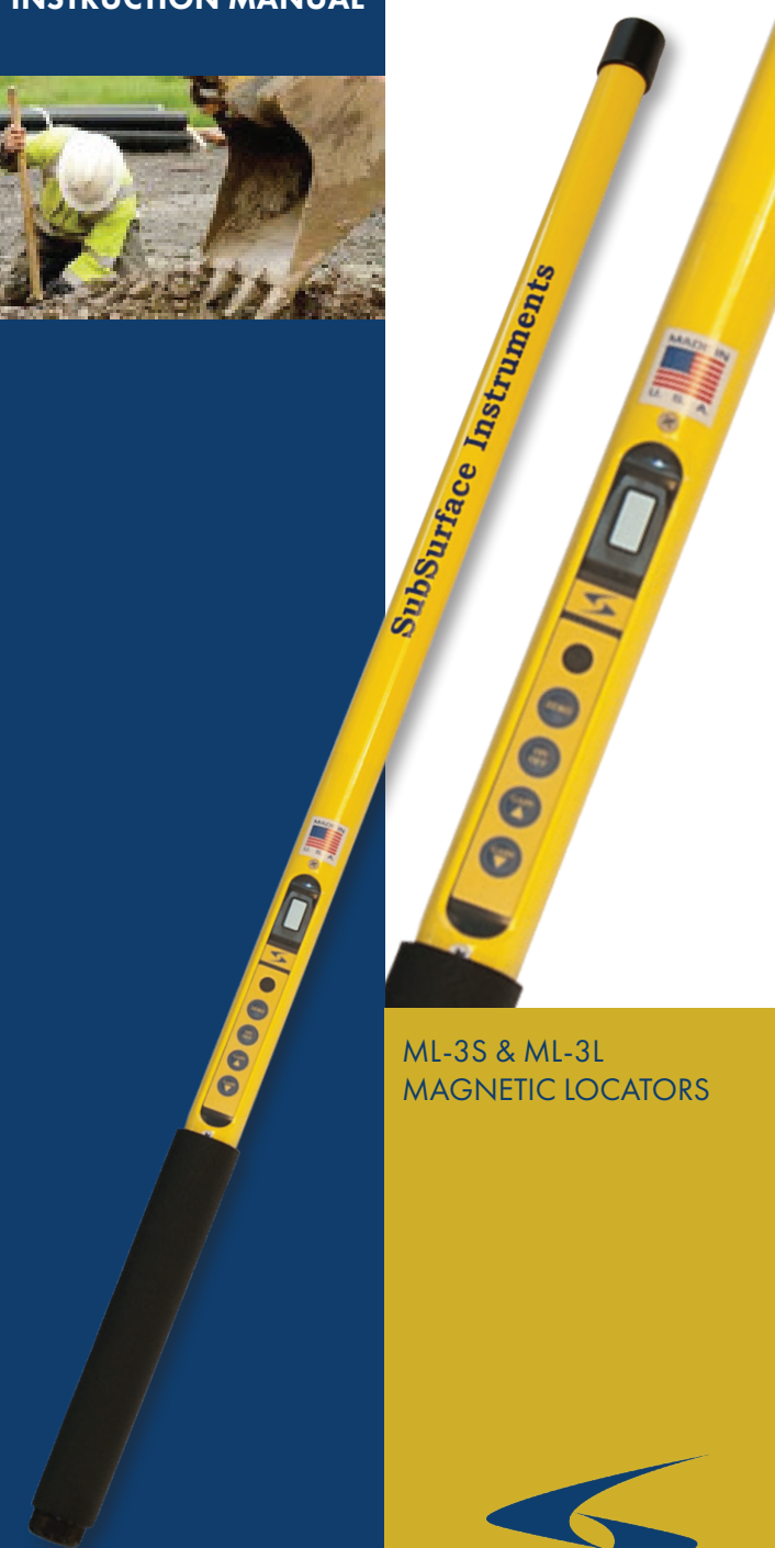
ML-3S & ML-3L MAGNETIC LOCATORS